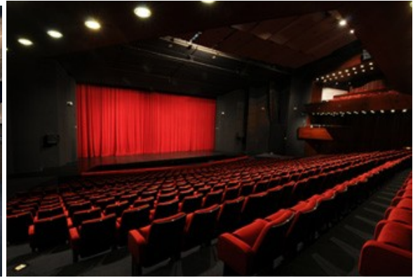
Great scene "Jovan Djodjevic"