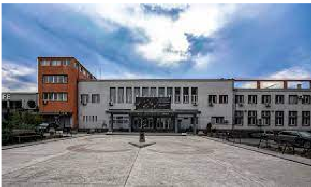
CULTURE CENTER VLADA DIVLJAN, MITROPOLITA PETRA 8, BELGRADE